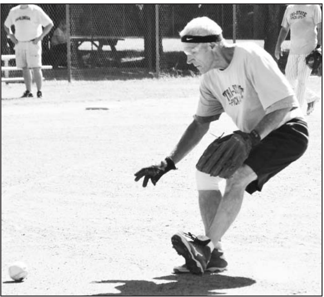
The Tri State Pickups swept a doubleheader from Lumpkin County last week at Meeks Park.

If you turn 58 before the end of the year and are looking to enjoy some fresh air, fellowship, while making new friends, and participating in a competitive softball league with games against other local seniors, then this could be right up your alley.