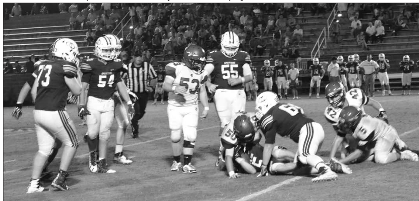
The Towns County defense brings down a Spartan ball carrier last Friday night.

The Tri State Pick Ups are currently in second place as of this writing.