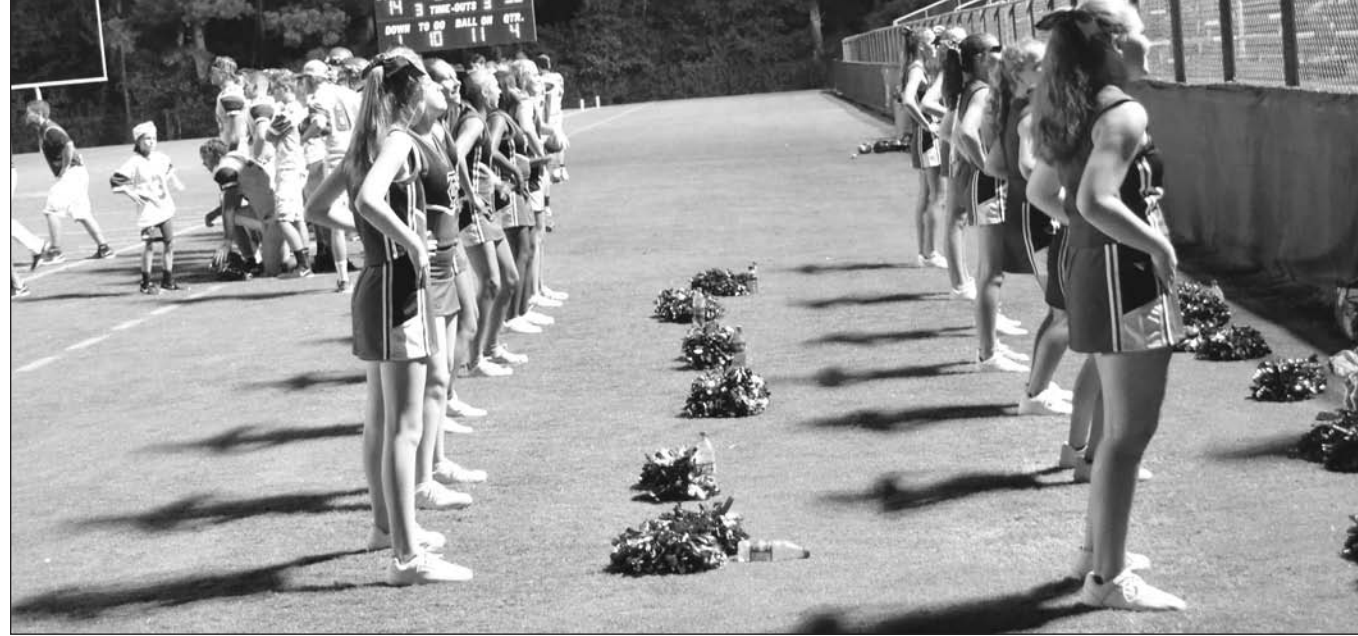
The dedicated Towns County cheerleaders made the trip to Athens on Friday night.